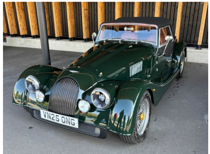
Plus Four - 4cyl BMW Twin Turbo - 255bhp