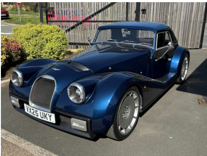
Supersport - 6cyl BMW Twin Turbo - 335bhp

Almost all the events in the calendar require you to have one of these licences as a minimum to compete, either as a driver or passenger. If you go to the above webpage, you can order your free licence, but please make sure you don't leave it to the last minute.