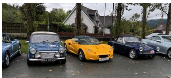
Hotel car park Saturday, before the rain!