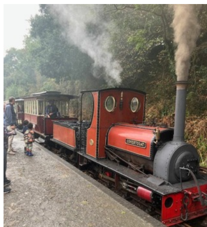
Launceston Steam Railway

I missed last month's Drink and a Chat, as we were down in Cornwall on holiday again, the weather was typical, with both sunny and rainy days, although luckily more sun than rain and we enjoyed both the beach and other interests such as steam railways etc. as you will see from the photographs. However, the holiday didn't get off to a good start, as after loading the car up on the Friday evening, so we could have an early start at 8am on the Saturday, I came down in the morning only to find that after opening the car and the boot ready to load last minute things, I couldn't then lock the boot or start the car!