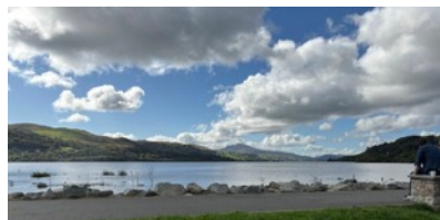
View across Bala Lake