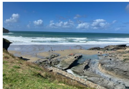
Beach at Trebarwith Strand

is the second time I have had this problem, it would seem that modern batteries don't fade away, they just work one moment and then die completely the next, with no warning.