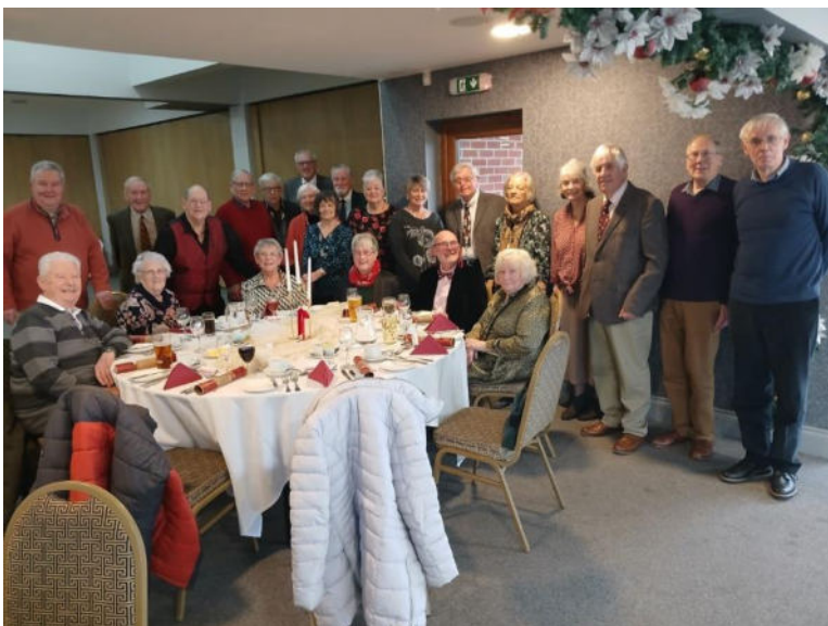
Photo from Tamar Group showing their Christmas lunch which took place on the 11 th of this month!