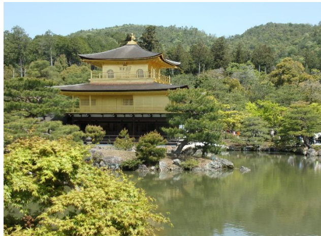
Golden Temple, Kyoto

And finally ... the all-important travel stats: