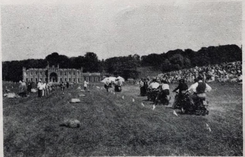
MUSICAL CHAIRS ON MOTOR CYCLES

But as the afternoon wore on the spectators looked expectantly towards the Signals Trick Riders who had arrived and ridden in single file in excellent style into the grounds. On enquiry we ascertained that they had not ridden all the way from London like that, but only from the