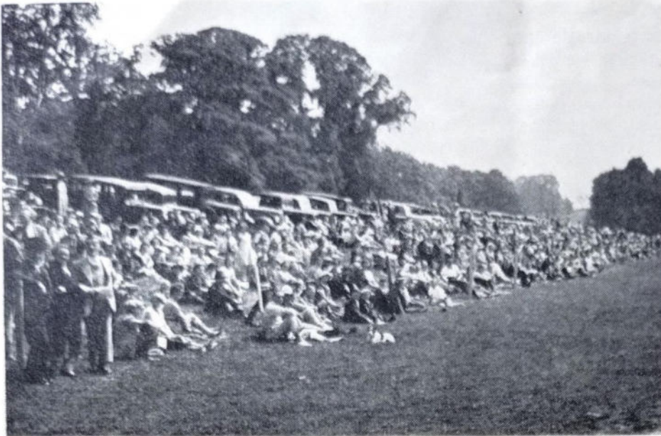
A SECTION OF THE CROWD

Following on from last month's report of the 1937 CB Rally, here is a write up for the rest of that weekend's activities, with some "interesting", to say the least, Gymkhana competitions...!