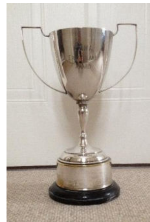
The Eric Blake Cup