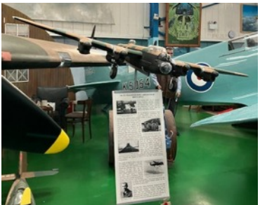
Aviation Group visit to Tangmere.