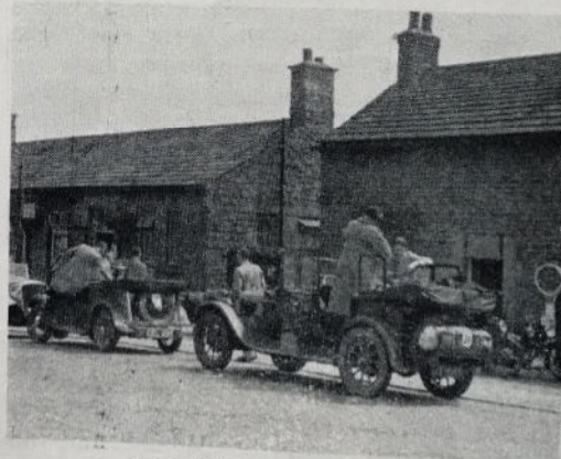
THE SHEFFIELD CHECK