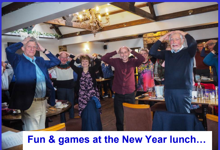
Fun & games at the New Year lunch...