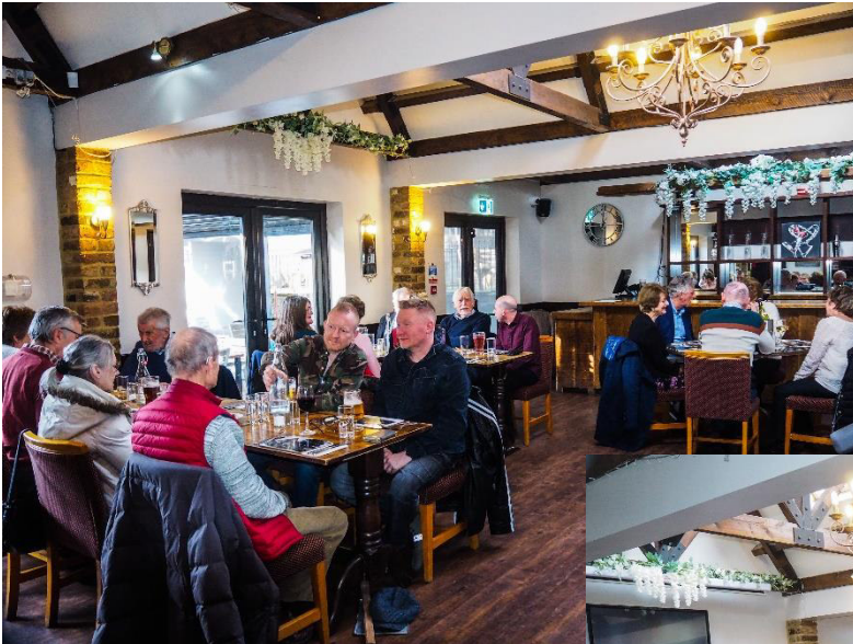
A couple more photos from the New Year Lunch