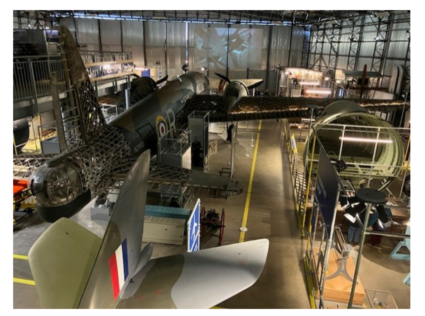
More of Mike's pictures from the HRCR Open Day and the Brooklands visit