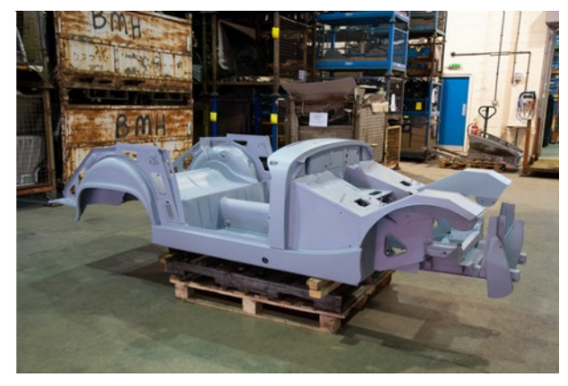
British Motor Heritage Ltd, Range Road, Cotswold Business Park, Witney OX29 0YB

With unparalleled knowledge, authentic production information and original drawings and patterns, the factory manufactures previously unattainable body parts for British classic cars such as Mini's, Morris Minors and more! Watch the craftsmen working and get a unique insight into the whole process.