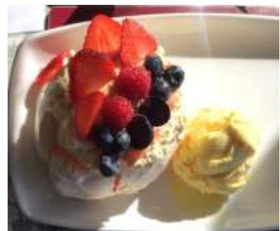
Not surprisingly – the Pavlova was a favourite choice of dessert!