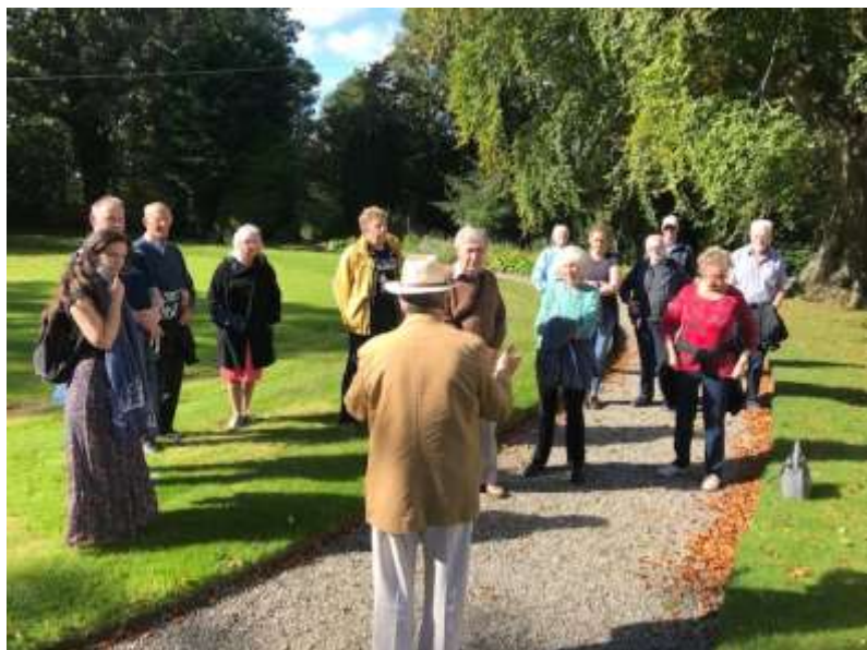
Kingdom of Fife Group did their bit for National Get Out Day on 26 th September, with a group trip to the stunning Dunimarle Castle.