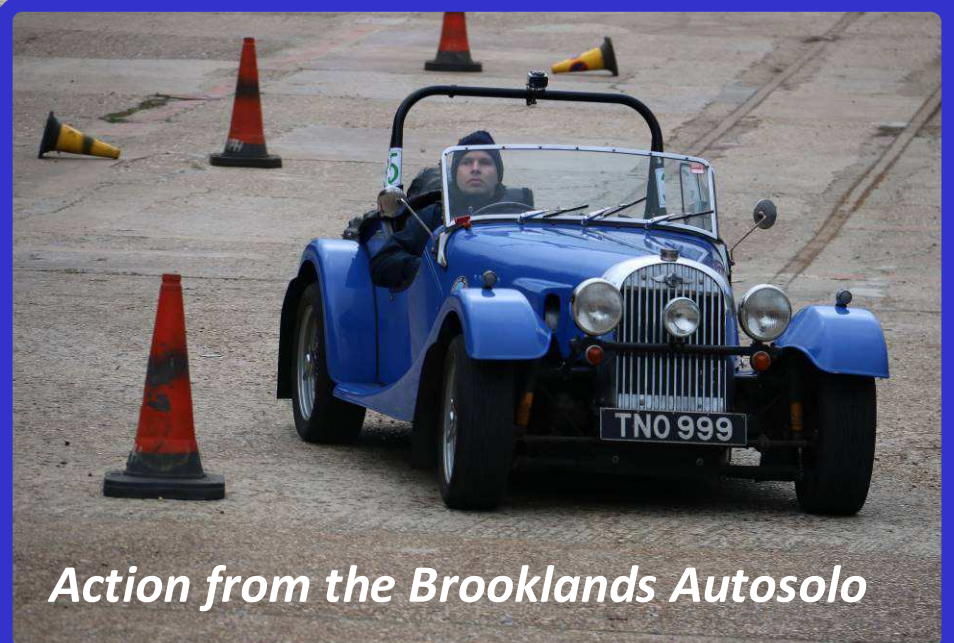
Action from the Brooklands Autosolo