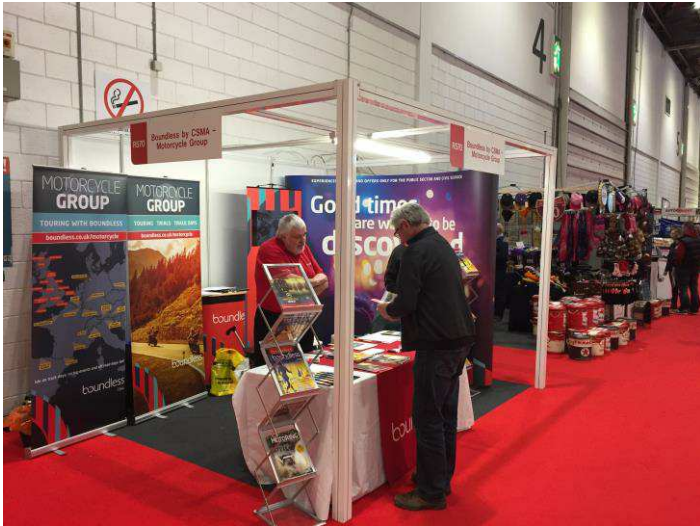
A rare moment of quiet for the Boundless Motorcyclists at the MCN Motorcycle Show

Our Boundless Motorcycle Group enjoyed an enjoyable and productive 3 days at the MCN Motorcycle Show at Excel, London over the 16 th to 18 th February.